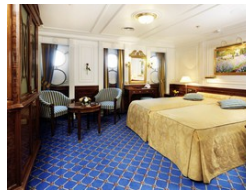
Category E. From