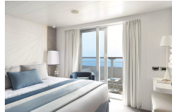
Grand Privilege Suite