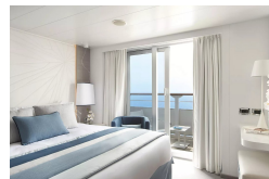
Grand Privilege Suite