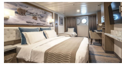
Aurora Stateroom Triple Share