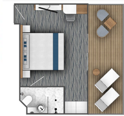
Category C Stateroom - Balcony Stateroom