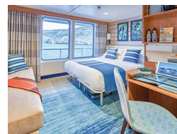
Category 5 Suite