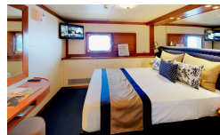
Orchid Cabins - Twin Share