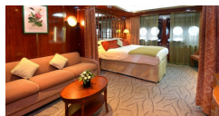
Magellan Deck Standard Suite