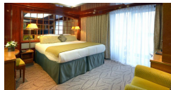
Magellan Deck Standard Single