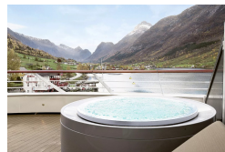
Prestige Stateroom Deck 4