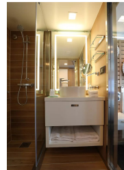
Prestige Stateroom Deck 5