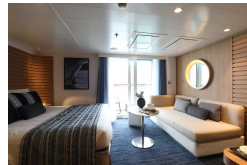
Grand Deluxe Suite