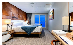
Promenade Deck Stateroom