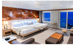
Bridge Deck Balcony Suite