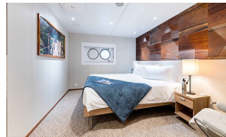
Explorer Deck Balcony Stateroom