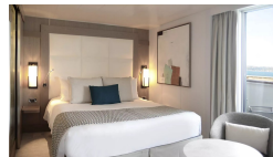
Grand Deluxe Suite