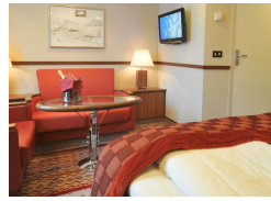
Polar Inside. From