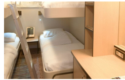
Polar Outside. From