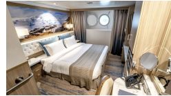
Balcony Stateroom - A