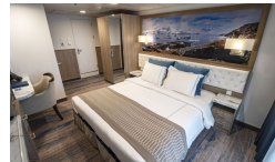
Balcony Stateroom - C Captain's Suite