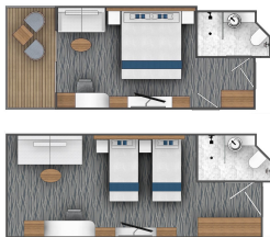
Category D Stateroom - Albatros Stateroom