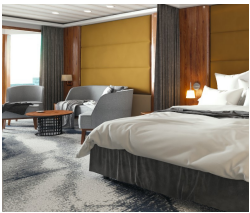
Polar Inside. From