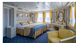
Standard Double/Twin Cabin