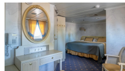
Owner's suites with private walkway