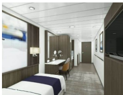
Aurora Stateroom Triple