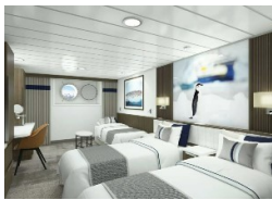
Aurora Stateroom Twin