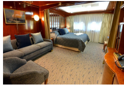
Byrd Deck Superior Sole