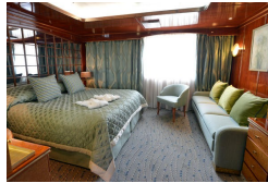
Mawson Deck Premium Suite