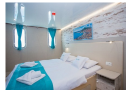
Main Deck Single