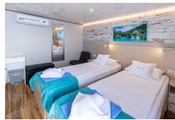
Lower Deck Single Cabin