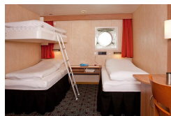
Cat 1A - Quad