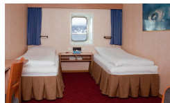
Cat 4 - Twin