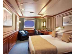
Category 1 Solo