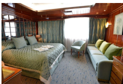
Shackleton Deck Owner's Balcony Suite