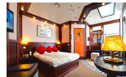
Tween Deck Economy. From