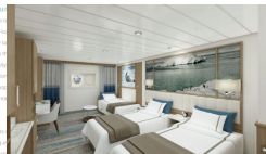
Balcony Stateroom B for single occupancy