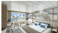
Balcony Stateroom Category B