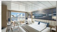
Balcony Stateroom B for single occupancy