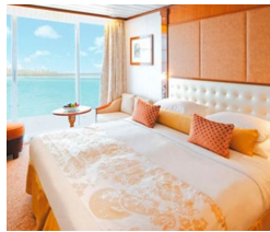
BALCONY STATEROOM S DECK 6