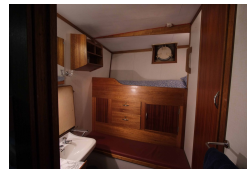
Single Cabin En-suite