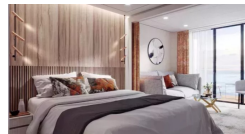
Balcony D5 - sold out