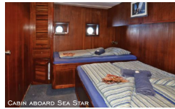
CABIN ABOARD SEA STAR