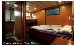
CABIN ABOARD SEA BIRD