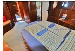
Single Occupancy Double Bed