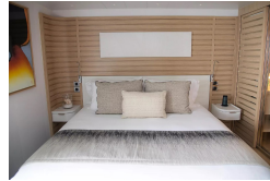
Grand Deluxe Suite