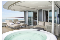
Prestige Stateroom Deck 4