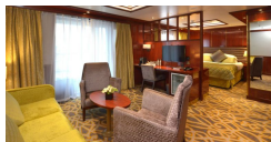
Explorer Deck Owner's Balcony Suite