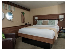
Category 2. From