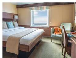
Category 5. From