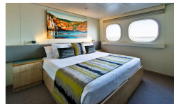
True North II - Explorer Class - Stateroom