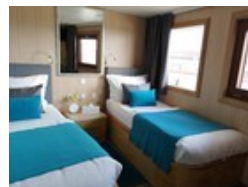
Upper Deck cabin with Terrace