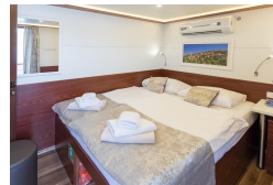
Lower Deck Cabin Single