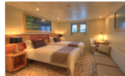
Main Deck A Stateroom