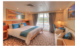
Bridge Deck Balcony Stateroom