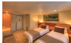
Promenade A Stateroom