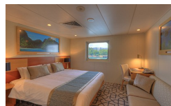
Promenade B Stateroom