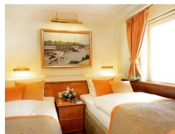
Category 5. From