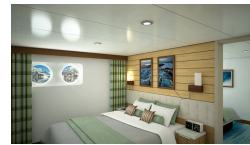
Category 1. From