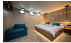
Upper Deck VIP Cabin