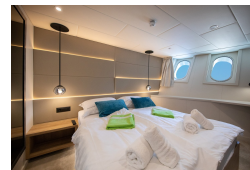
Upper Deck VIP Cabin