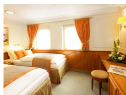
Category 4. From