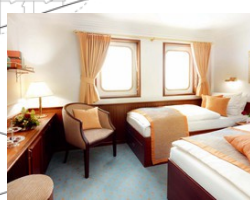
Category 3. From