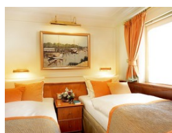
Category 5. From