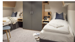
Interior Accessible. From