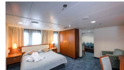
Cabin Category 2