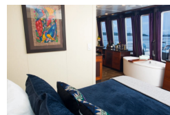
Jr. Commodore Suite