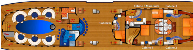
Main Deck Mini Suite