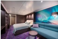
Triple Porthole Twin Porthole