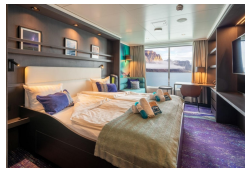
Quadruple Porthole Superior