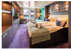
Triple Porthole Twin Deluxe Twin Porthole Twin Window