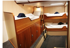
Twin Private Inside