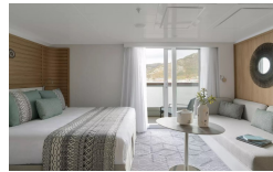
Grand Deluxe Suite