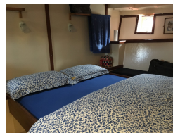
Twin Cabin En-suite