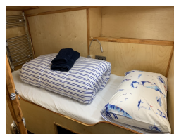
Twin / Double Cabin En-suite